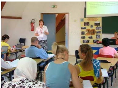
Adults & Youth from different countries discuss their projects using multimedia