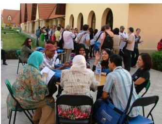
Moments of non-stop cross-cultural communication