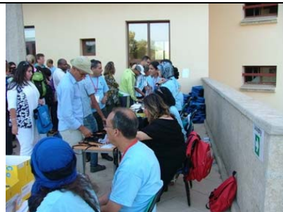
The organizing committee (in blue T-shirts) welcoming and registering the participants