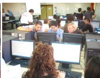
A workshop in a Computer Lab