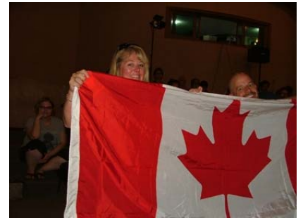
Knowing each other