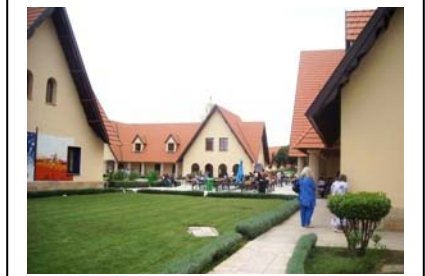
Preparations for open air Gala-dinner