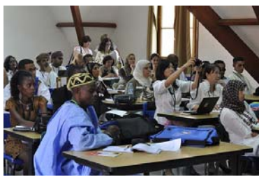
Different abilities have a place in iEARN