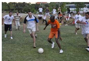
Afternoon activity: soccer match: international team