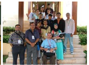
Youth & adults