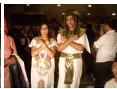
Evening : International Cultural Night