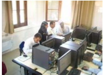
A Moroccan, American & Pakistani: so familiar