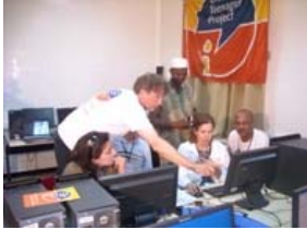
Concurrent Workshops for adults and youth