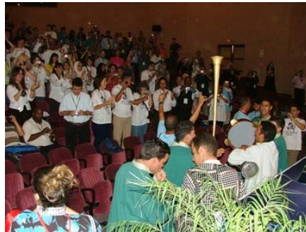
Folkloric welcoming party