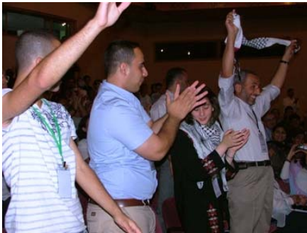
Knowing each other