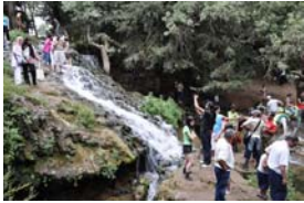
Afternoon : Hiking