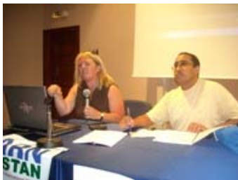
Plenary: Adobe Voices Project