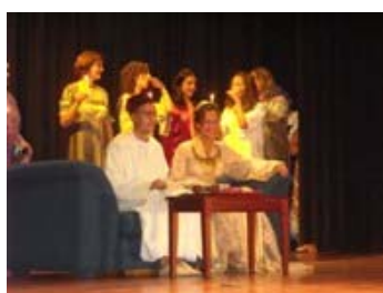
Moroccan wedding traditions with participation of international youth