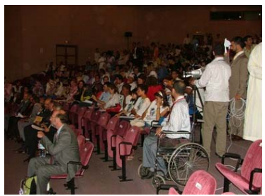
Friday afternoon: Closing ceremony