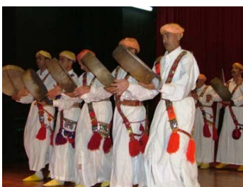
Evening activity: music show