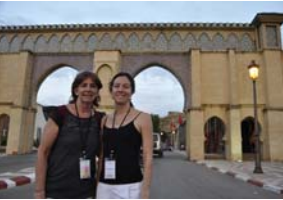
half-day tour to Meknes city and Volubilis