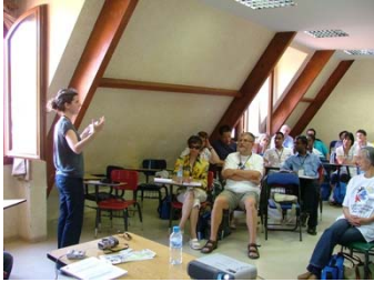
Concurrent workshops continue after official opening