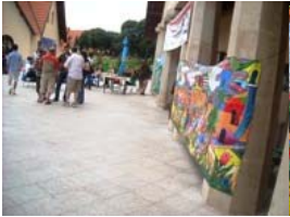
Afternoon: free time and murals exhibition