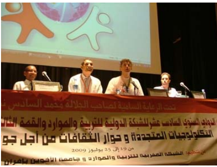
Welcoming speeches by officials of iEARN, MEARN & Al Akhawayn