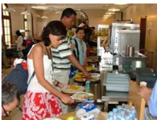
Participants at international food restaurant