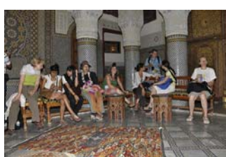
At the carpet shop