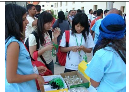
Youth organizing committee taking charge of their foreign peers.