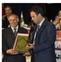
Awards by MEARN and other associations to Moroccan and iEARN International figures in gratitude of hard work