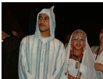
Evening: Moroccan cultural show