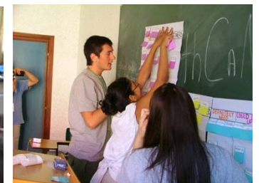
Youth collaborating at work