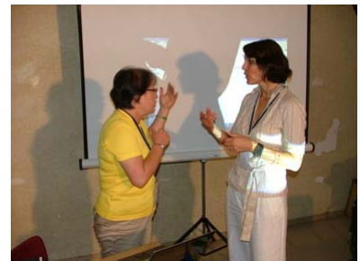
moments of non-stop dialogue