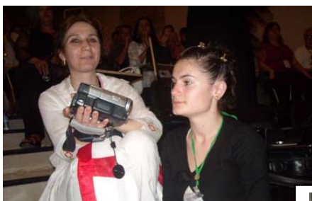
Smiling, sign of joy and self-fulfilment