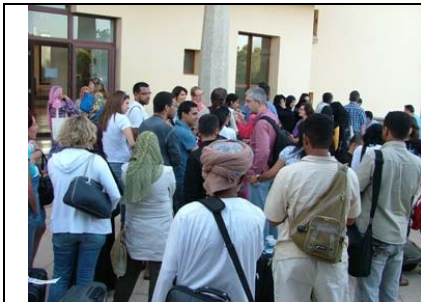
Participants from different cultures meet: communication is already taking place.